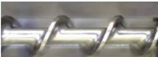
Stainless steel worm/auger with threaded worm pin for easy replacement.

SSMG 300/130 shown with lid closed. Please note the hygienic zone, inspection area between the worm/auger and the gear box. Including grill cover with magnetic switch. Please also note the Allen Bradley operator panel, PanelView AB 800.