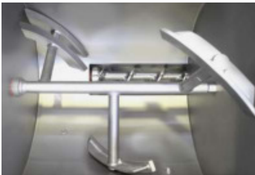
Inside of the 335 litres mixing container.